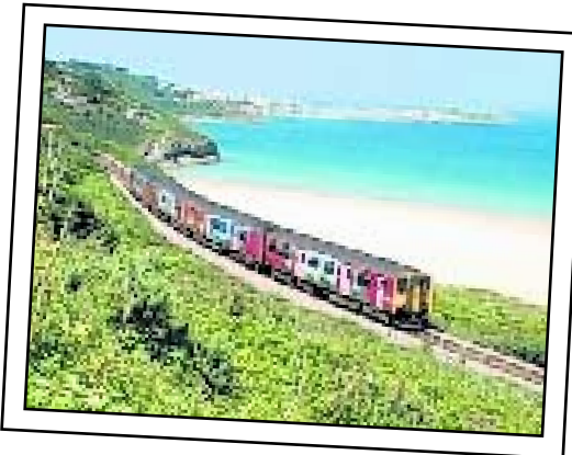
■ The coastal train line.

Past Carbis Bay and on to Lelant, there was the promise of a welcome pub lunch awaiting us, and after the five or six miles, we thought, it was well-deserved.